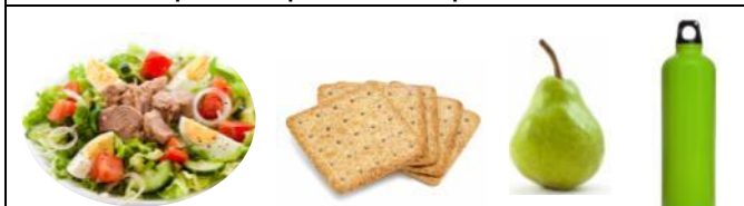
Salad with tuna, crackers, pear, and water