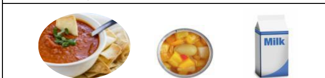
Chili with pita chips, fruit cup, and milk