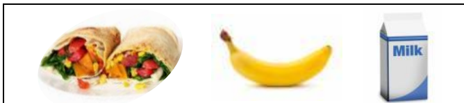
Tortilla rolled with turkey, shredded carrot, and spinach; banana; and milk