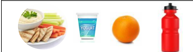
Pita wedges, hummus and fresh vegetables, yogurt, orange, and water