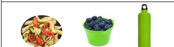
Pasta salad with vegetables and cheese, blueberries, and water